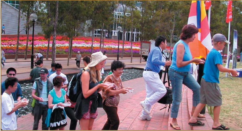
ABOVE: Practicing mindfulness by trying not to spill a container full of water, at the Buddhist New Year Blessings.